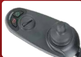
PG GC3 Controller

The sleek and elegant Jazzy® Elite ES-1 1 delivers high-class maneuvering with front-wheel drive technology. Enjoy effortless controls and a comfortable, high-back seat on this power chair. Choose Jazzy every time.