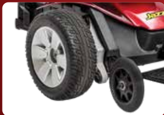
Front-wheel drive design