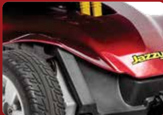
Easy-access freewheel levers